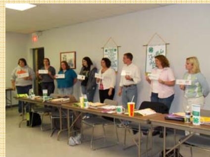
New Advisor Orientation