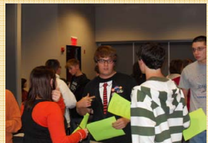
Jr. Fairboard Mixers