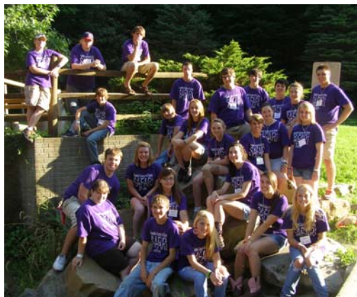
2009 Franklin County 4-H Camp Counselors

Any 4-H member who will be 14 years old by January 1, 2010 is eligible to apply for a position as a Camp Counselor at this year's 4-H Camp to be held June 21-25, 2010, 4-H at Camp Ohio. Interested individuals should complete the application and return it to the Extension Office no later than December 31 st , 4:30PM. More information and the application can be found at: http://franklin.osu.edu/topics/4-h-youth-development/forms